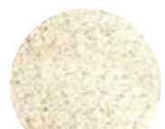
SILVER GREY TEXTURED