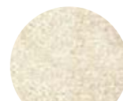
SILVER GREY SMOOTH